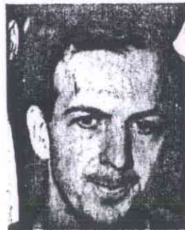
Was E. Howard Hunt (right) in Dallas that fateful day in 1963 to kill Lee Harvey Oswald (left) after the assassination?

According to sources close to the Select Committee on Assassination, the document reveals: